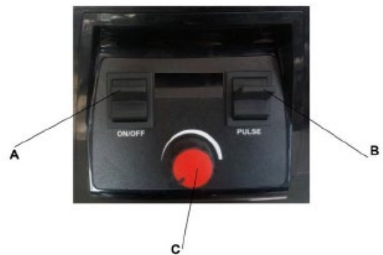
Figure 1 Control Panel